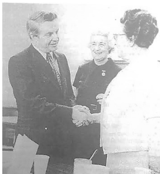
Premier Lougheed congratulating Society pioneers at the official opening

Public meetings were held in key communities throughout the city and consultations were held with Health & Welfare Canada, the Canadian Welfare Council and other professional bodies. As a result of this study, a steering committee was struck to form an organization to meet the needs that had been identified: a warm, friendly and welcoming climate to provide a focal point for older people, where their needs and suggestions would be dealt with.