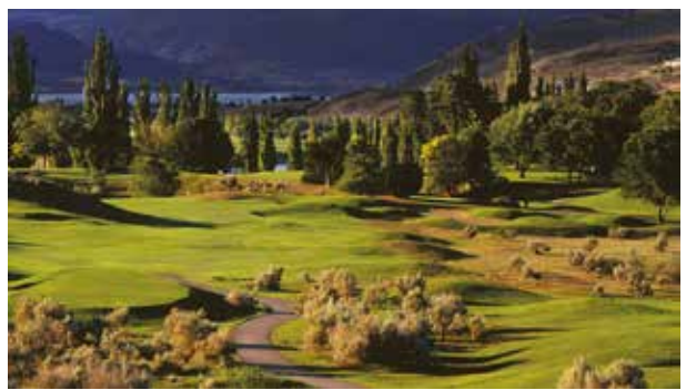
Osoyoos Golf and Country Club