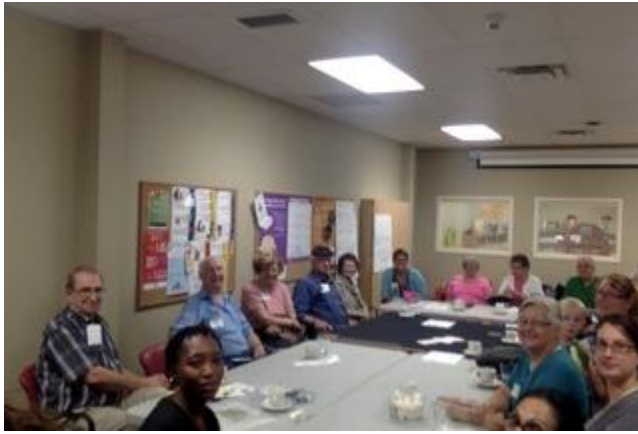
Figure 2 - Community Conversation Meeting held at Penny McKee Library, September 2014

Initially, the project team hosted several focused conversations with the community on how seniors could support children living in poverty in their neighbourhood. They listened for past history, current activities, and common themes. This slow and steady approach built a solid foundation upon which ideas could be nurtured and acted upon. An intentional community development approach was used by the animator. It was understood that although this project was short-term (one year), this type of approach was needed to ensure the project was