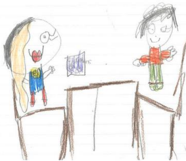
Grade 1/2 Student, R.J. Scott School, May 2015.