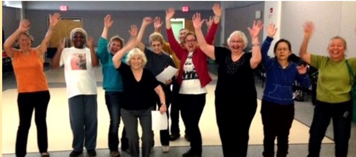
Some of the participants in a recent Zumba Gold class at Sage